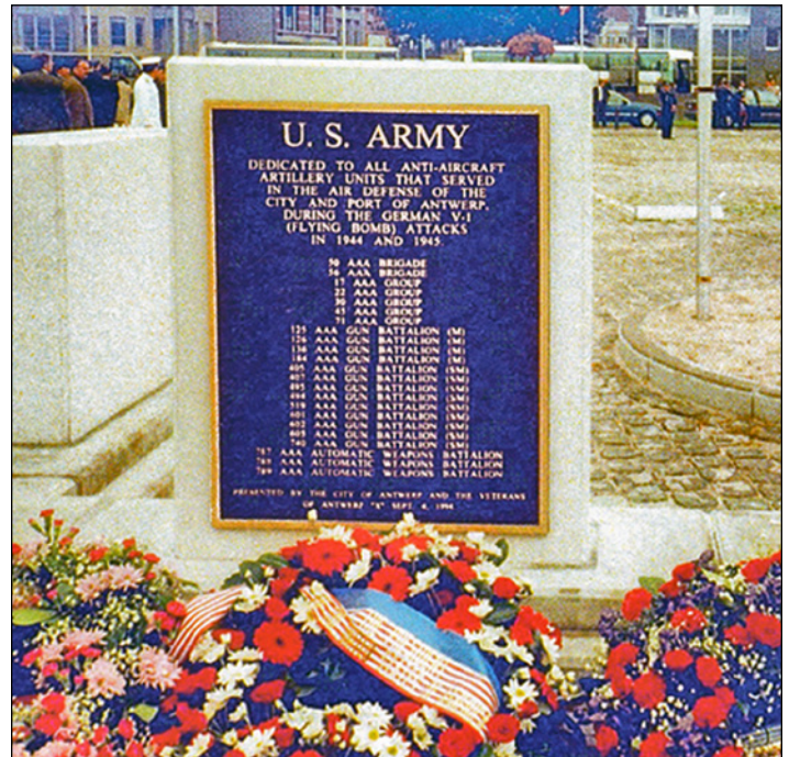
Antwerp, BE monument honoring the American AAA gun battalions

In 1994, I returned to Antwerp for the 50th anniversary. We dedicated a monument honoring the American AAA battalions who defended the city from V-1s. I was honored to lay a wreath sent by President Clinton. The Belgian government thanked us. It was a moment of pride and memory—a tribute to the lives saved, and to those who did not come home.