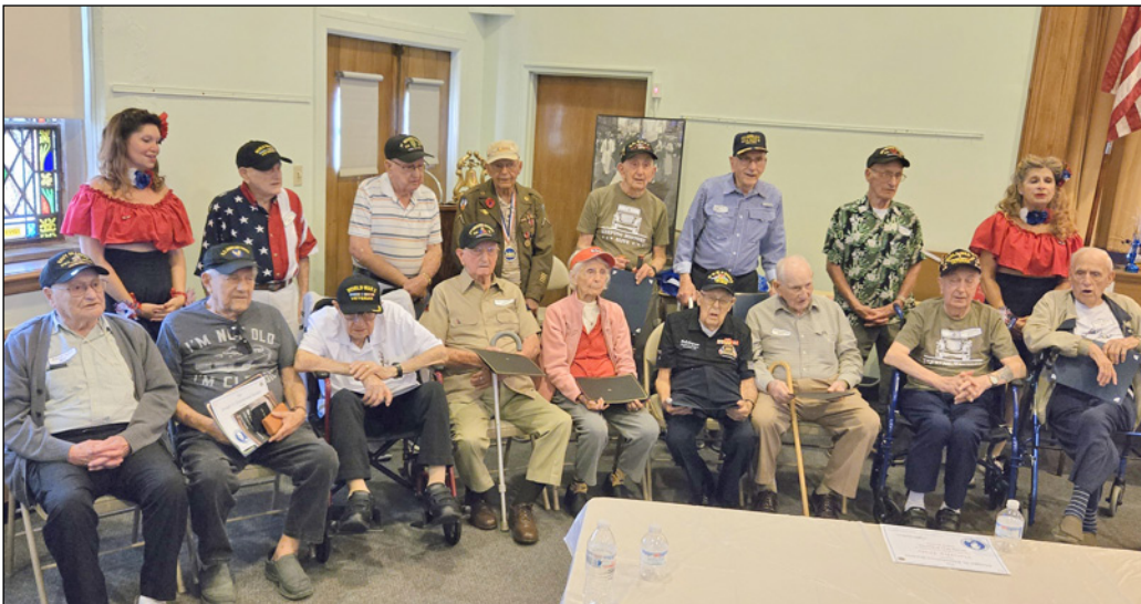
Lehigh Chapter veterans