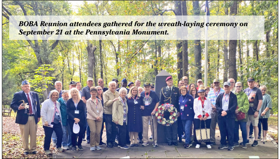
BOBA Reunion attendees gathered for the wreath-laying ceremony on September 21 at the Pennsylvania Monument.

The Friends of the Medal of Honor Grove continue to preserve the landscape and enhance its memorial spaces, ensuring this remarkable site remains a place of remembrance, education, and inspiration.