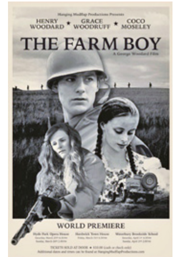
The Farm Boy Movie Premiere Poster

The movie had a series of screenings in Vermont this past winter and the producers agreed to share a portion of the proceeds with BOBA. This led to a donation of $1500. BOBA is extremely grateful for this donation. The connection between the film's story and BOBA's mission made the gift especially meaningful.