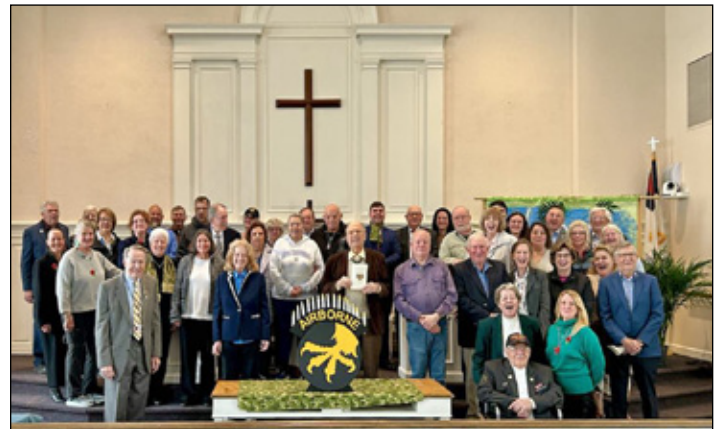
Right: 17th Airborne Reunion attendees at Gettysburg Presbyterian Church after candlelight ceremony.