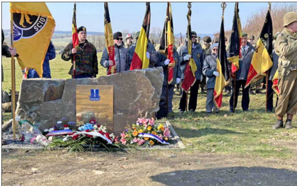
17th Airborne ceremony at Renuamont Memorial