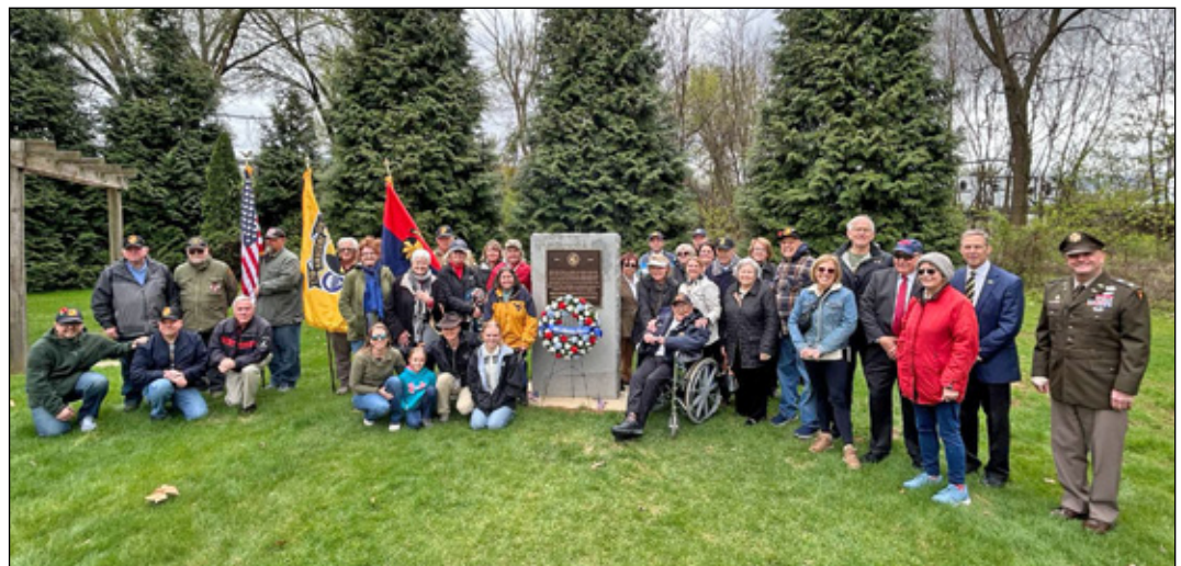
17th Airborne Reunion attendees at the Bulge Monument at AHEC in Carlisle, PA.