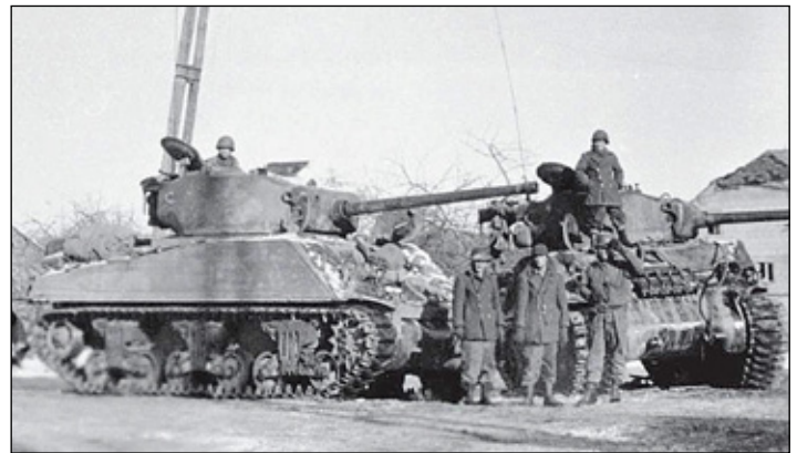
Tanks of the 771st Tank Battalion in Berismenil, Belgium, on 14 January 1945.

As reinforcements poured in from the north and south, more STBs joined the fight. My grandfather served in the 771st STB, attached to the 84th Infantry Division near Marche, Belgium. On Christmas Day, Company B of the 771st repelled an attack by a German armor company from the 116th Panzer Division near the town of Verdenne, destroying nine Panthers and Mark IVs at the cost of one Sherman tank—the battalion's largest tank-on-tank engagement of the war.