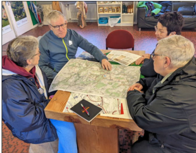
Discussions regarding the liberation of Echternach, Luxembourg with the secretary of tourism and a retired professor.