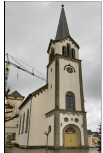
Church where 159th took refuge in Altrier.