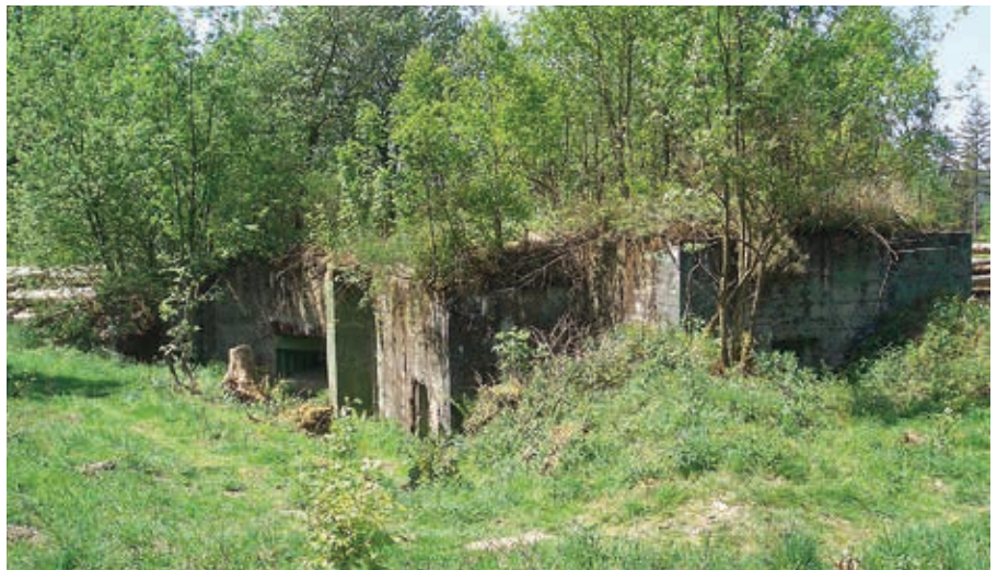
Siegfried Line bunker, Hürtgen Forest.

On September 11, 1944, a patrol from the 22nd REGT of the 4th INFD became the first Allied ground force to enter Germany. The 4th INFD's MG Raymond Barton was the first Allied general to enter Germany, on Sept 14. Slow progress into Germany continued in Oct and on 7 Nov, they entered the Battle of Hürtgen Forest where they