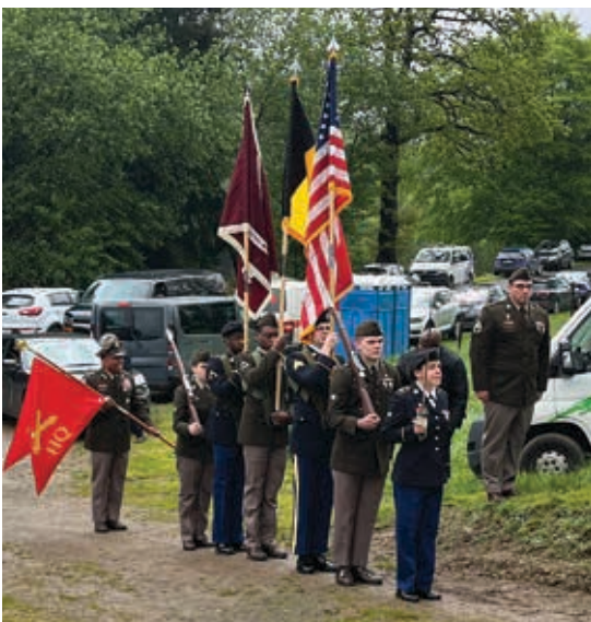
ABOVE PHOTO: Color guard awaits start of ceremony.