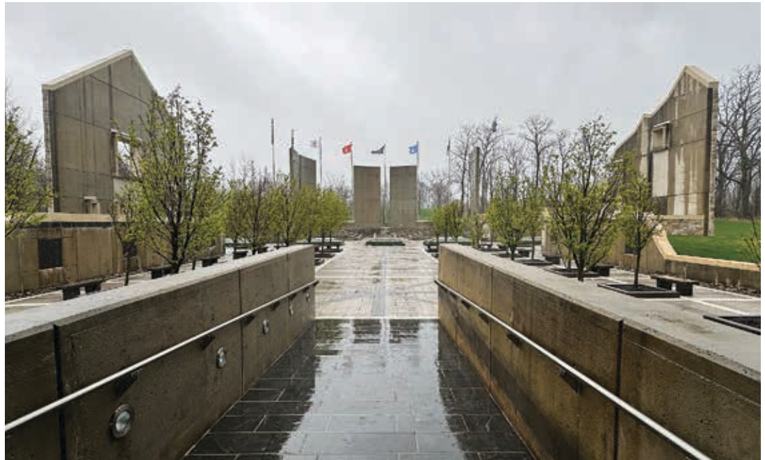
28th Division Memorial at Fort Indiantown Gap National Cemetery.