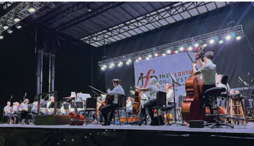
... and The Florida Orchestra plays it.

To view the performance online, go to: https://www.youtube.com/watch?v=wDs6QhhN8pM