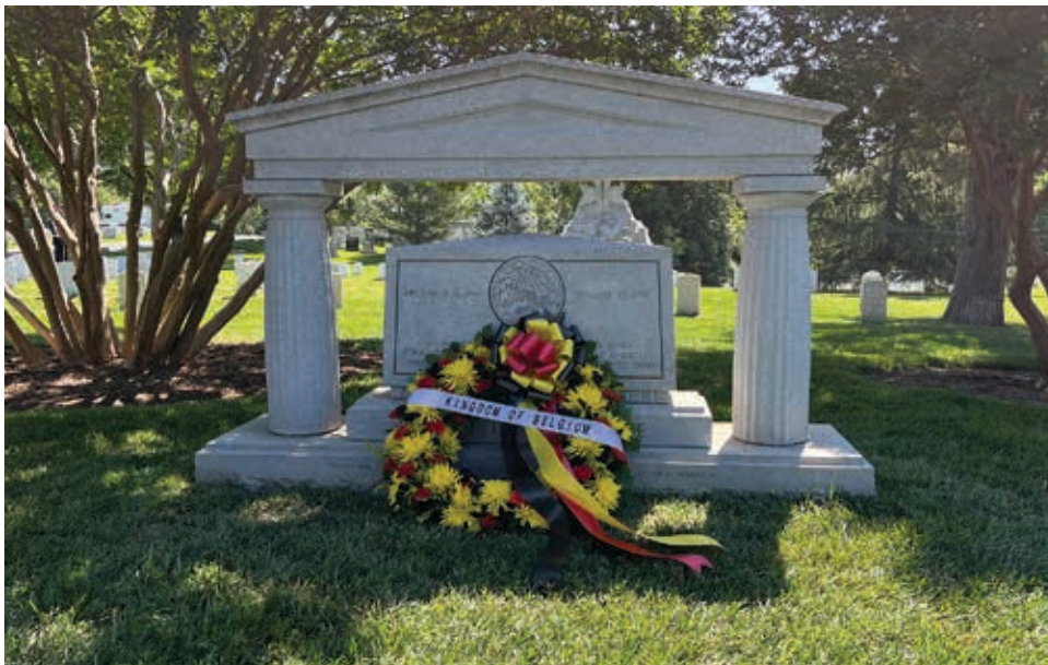
Memorial wreath placed at Arlington National Cemetery Bulge monument by Belgian Prime Minister, Alexander De Croo.