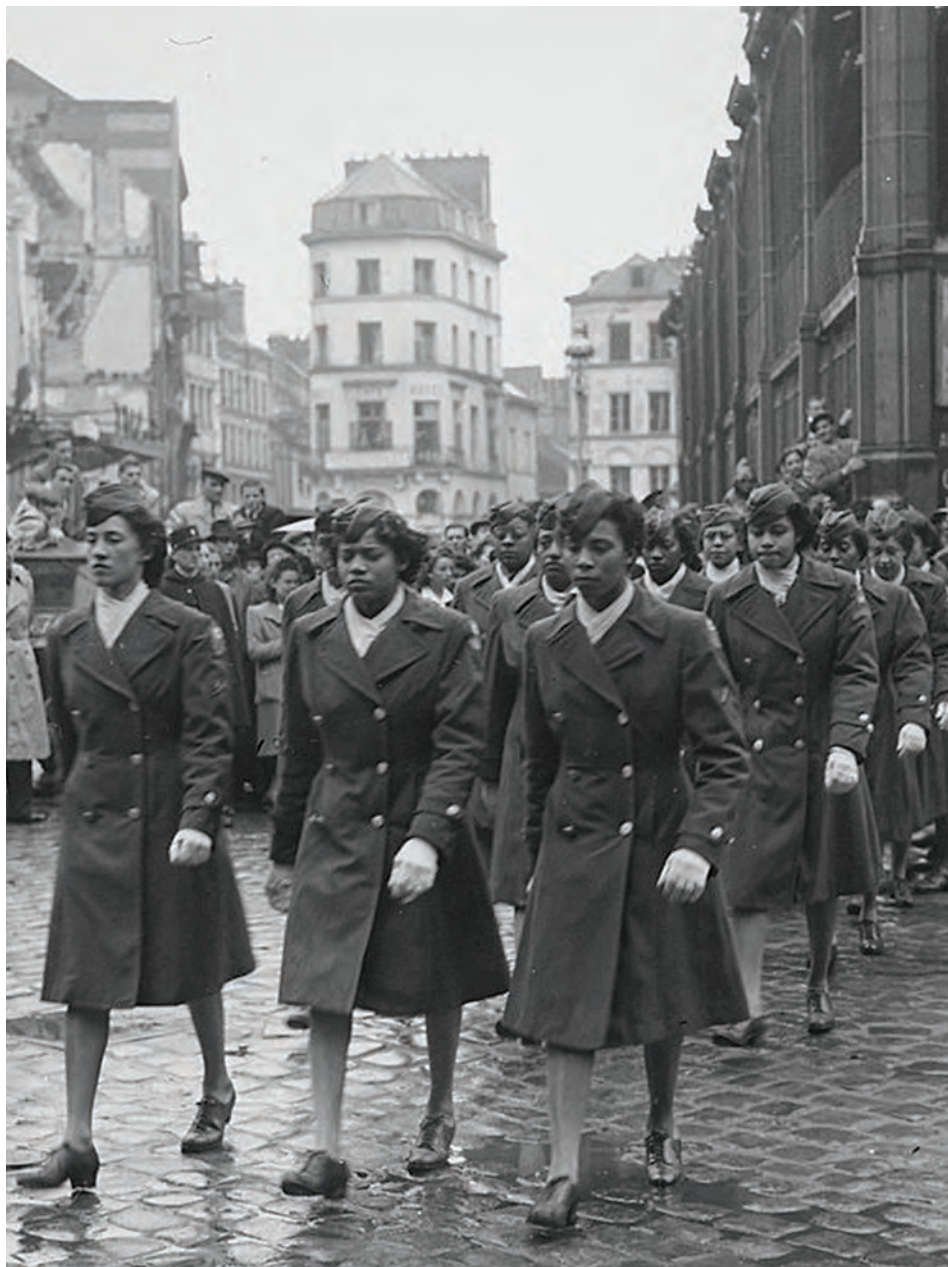
Members of the 6888th Central Postal Directory Battalion marching in a parade in France (1945).