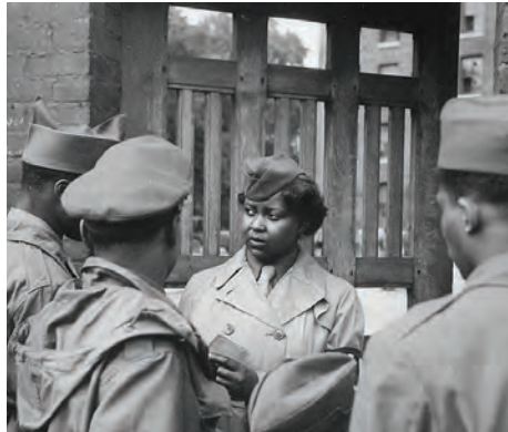
An unidentified member of the 6888th Central Postal Directory Battalion after arriving in Europe.

Although not a participant in the Battle of