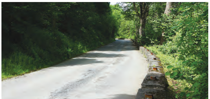
bridge. Both photos were taken during the author’s visit to Belgium in 2016 for his book research. Both shots are of the road leading to the Stavelot bridge, where Peiper’s SS Panzer column halted, as related in the article.