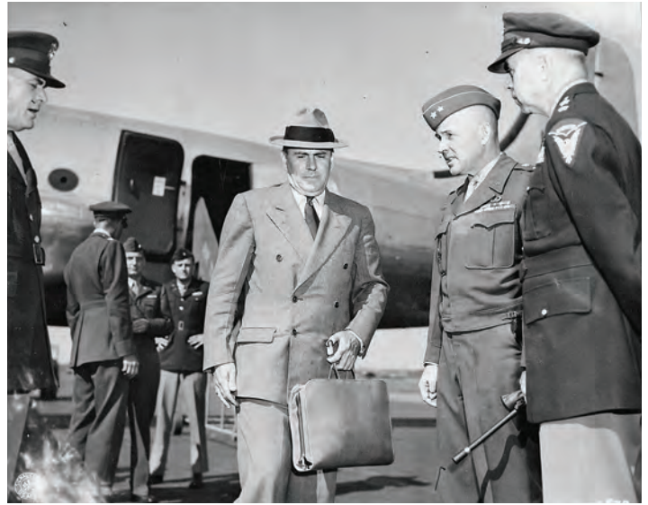
John J. McCloy, Assistant Secretary of War, arriving At Gatow Airport in Berlin, Germany to attend the Potsdam Conference