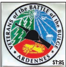
#7. logo decal 4" 2 for $1.25 #8. Windshield 4" 2 for $1.25