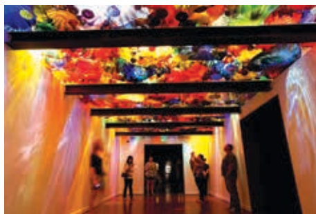
Chihuly Garden and Glass Museum