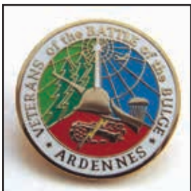
#3. VBOB logo enamel lapel pin 1 1/2" $6 $4.50