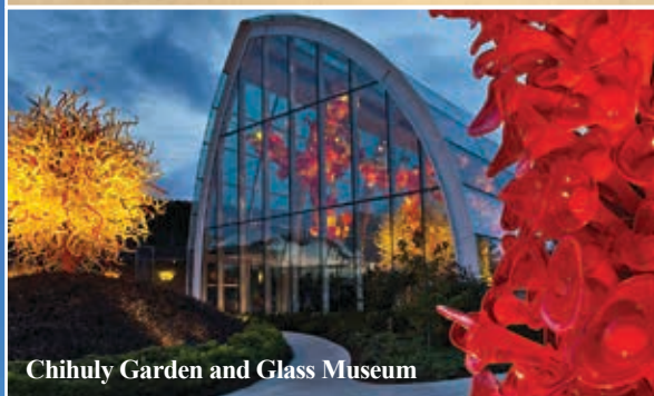
Chihuly Garden and Glass Museum