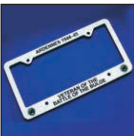
#9. License frame (white plastic with black type) $7 $5