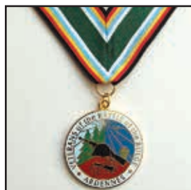
#6. Large VBOB neck medalion with a ribbon $25 $20

Item/price Quantity Total #1. $4.50 $4.50 x _____ = $ _____ #2. $5.50 $5.50 x _____ = $ _____ #3. $4.50 $4.50 x _____ = $ _____ #4. $12 $12 x _____ = $ _____ #5. $28 $28 x _____ = $ _____ windbreaker size: circle one S M L XL XXL XXXL #6. $20 $20 x _____ = $ _____ #7. 2/$1.25 2/$1.25 x _____ = $ _____ #8. 2/$1.25 2/$1.25 x _____ = $ _____ #9. $5 $5 x _____ = $ _____ #10. $7 $7 x _____ = $ _____