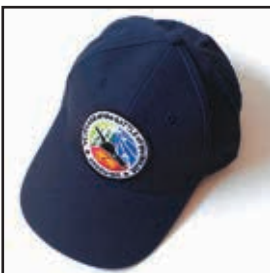
#4. Navy baseball cap with 3" logo patch $15 $12