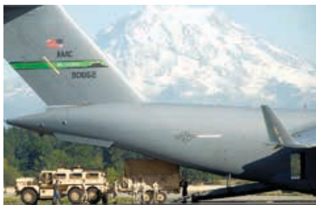
Joint Base Lewis-McChord

1) Sign up by September 12. (No exceptions. Late registrants cannot go on the base trip.)