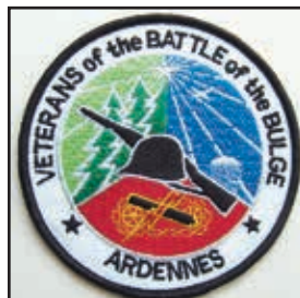
#1. Logo patch 3" $5.50 $4.50 #2. Logo patch 4" $6.25 $5.50

Telephone number _____ E-mail address _____