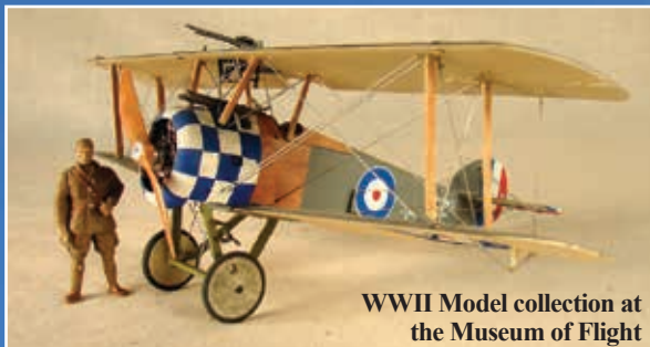
WWII Model collection at the Museum of Flight

See pages 12-15 for full registration details.