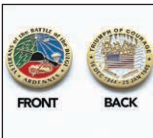
#10. Challenge coin 1 3/4" (gold tone with colored enamel) $14 $7