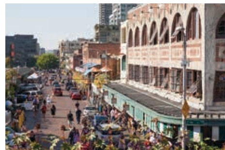
Pike Place Market

Visit the Boeing Museum of Flight (the #2 place to see in Seattle by Trip Advisor). It is the largest private air and space museum in the world (150 aircraft). They have 25 aircraft from WWI and WWII on display. It has the largest collection of model aircraft, including every plane from both wars. They have a cafe where we can have lunch (at your own timing). For more information about the Boeing Museum of Flight: www.museumofflight.org/ . After free time in the afternoon, we will have our traditional Reception and Banquet at the hotel.