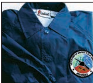
#5. Navy windbreaker with 4" logo patch $36 $28

Item/price Quantity Total #1. $4.50 $4.50 x _____ = $ _____ #2. $5.50 $5.50 x _____ = $ _____ #3. $4.50 $4.50 x _____ = $ _____ #4. $12 $12 x _____ = $ _____ #5. $28 $28 x _____ = $ _____ windbreaker size: circle one S M L XL XXL XXXL #6. $20 $20 x _____ = $ _____ #7. 2/$1.25 2/$1.25 x _____ = $ _____ #8. 2/$1.25 2/$1.25 x _____ = $ _____ #9. $5 $5 x _____ = $ _____ #10. $7 $7 x _____ = $ _____