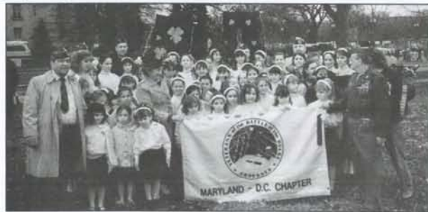
After the parade a group of grade schoolers asked to have their picture taken with the VBOB banner of the Maryland/DC Chapter.