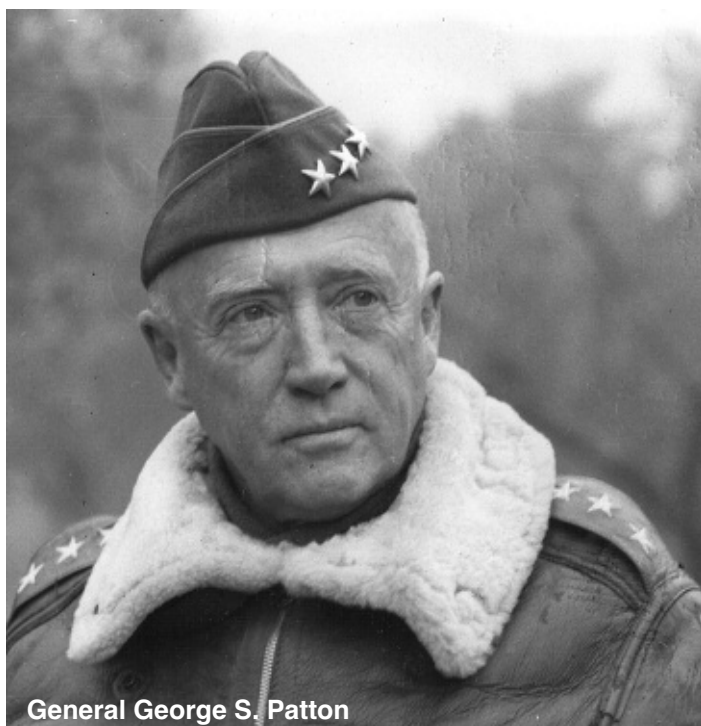
General George S. Patton

After the Communist collapse in late 1989, Pilsen enthusiastically launched the Pilsen Liberation Festival to celebrate twice being liberated by the Americans and they have been celebrating annually ever since. All this is crystallized in the three-day Liberation Festival in which Americans are guests of honor, especially Veterans of Third Army and their families. But all US Veterans, their families and friends are warmly invited to join this unique and historic tour. Feel the warmth and gratitude in Pilsen's welcome to us.